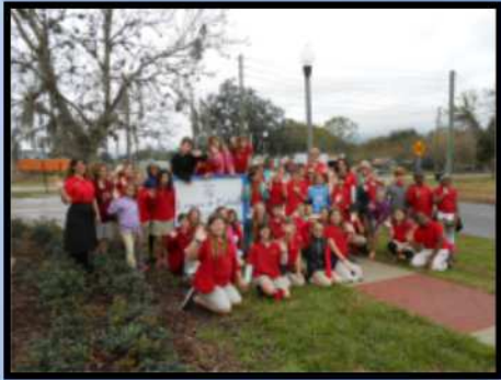
Orangewood Christian School brought in donations and toured our new facility.