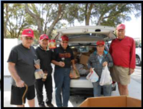
The Red Caps of Zellwood Station Annual Food Drive collected almost three truck loads of food. We love our Red Caps!