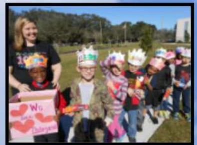
Clay Springs Elementary School yearly tradition continues! Celebrating the 100th day of school, each class collected 100's of food items for Loaves & Fishes!