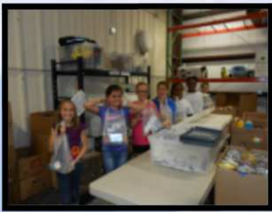
Students from Apopka Elementary School Honor Society visited Loaves & Fishes bringing lots of great food donations!